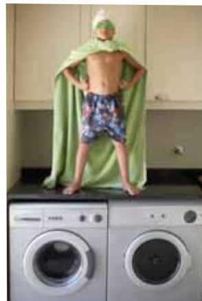
At Blue Ridge Electric, we have lots of ideas to help you become an energy efficient "super hero!" Go to BlueRidgeEMC.com and click on the Energy Tips icon.

Front-loading clothes washers use a horizontal or tumble-axis basket to lift and drop clothing into the water, instead of rubbing clothes around a central agitator in a full tub. These units use less energy than conventional clothes washers by reducing the amount of hot water needed to clean clothes. Front-loading models also squeeze more water out of clothes by using spin speeds that are two to three times faster than conventional washers, thereby reducing drying time and energy use.